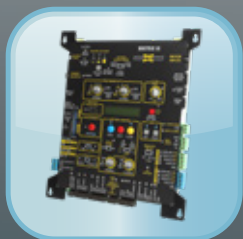
Control Board MATRIX III