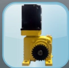
Large 24V Brushless DC Motor Equal to 2 1/2 HP AC motor Direct Gear Drive Size 70