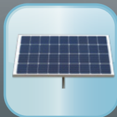
Solar 24V DC Input