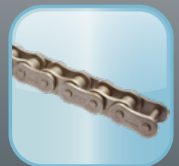
Chain Size 50 Nickel Plated